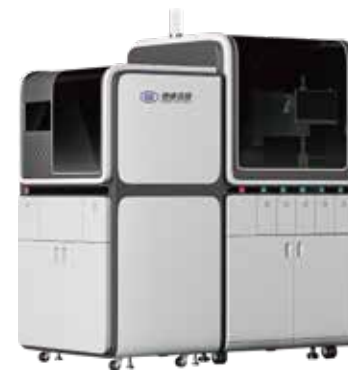
■ Blood Sample Transport System